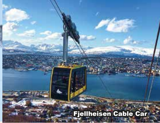
Fjellheisen Cable Car