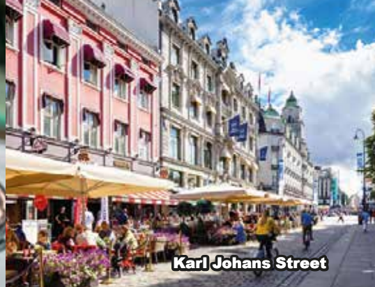
Karl Johans Street