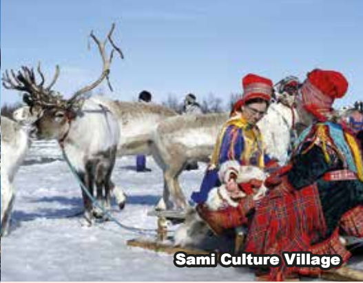
Sami Culture Village