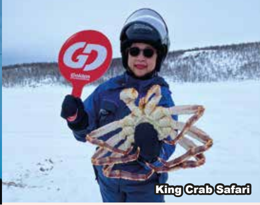
King Crab Safari