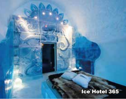
Ice Hotel 365