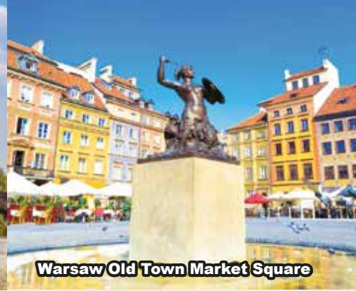
Warsaw Old Town Market Square