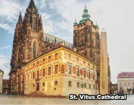
St. Vitus Cathedral