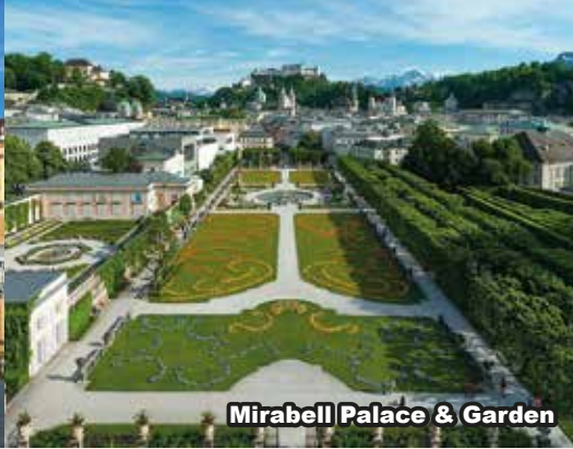
Mirabell Palace & Garden