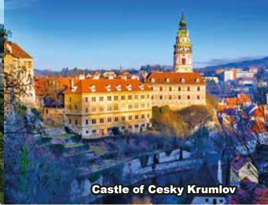
Castle of Cesky Krumlov