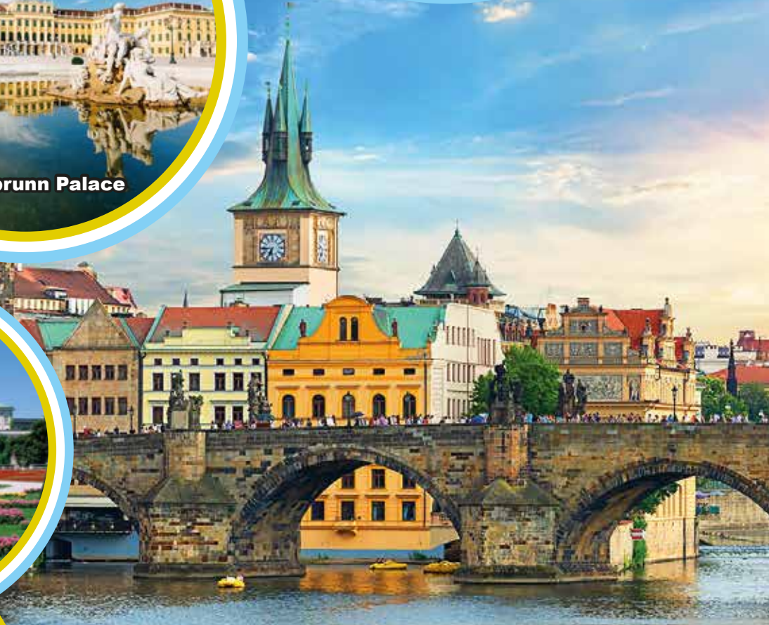
Prague Charles Bridge