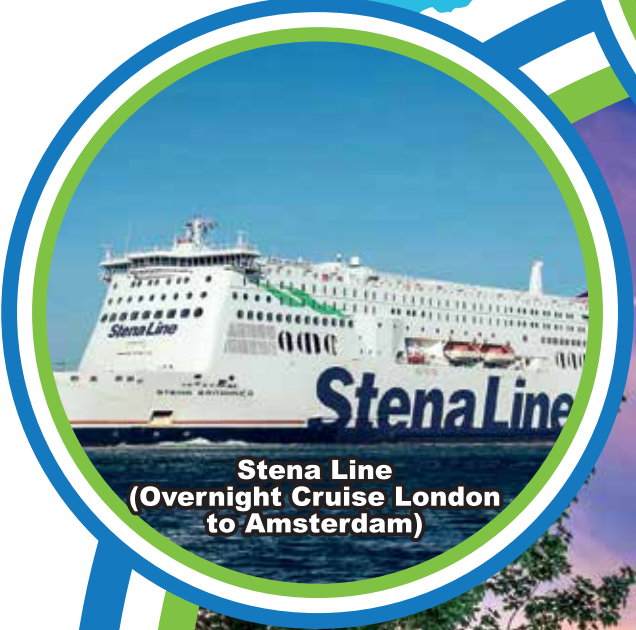
Stena Line (Overnight Cruise London to Amsterdam)