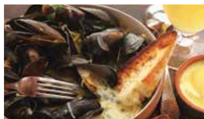
3 Course Meal –Mussels Meals

Disclaimer: Due to Covid-19 travel restrictions, local / religious festivals, public holidays, weather condition, transport technical issue, acts of nature, Golden Destinations reserved the right to alter the sequence or change, amend or alter the itinerary if necessary, with or without prior notice.