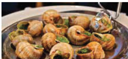
3 Course Meal – French Cuisine with Escargot