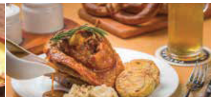
3 Course Meal – German Lunch with Pork Knuckle