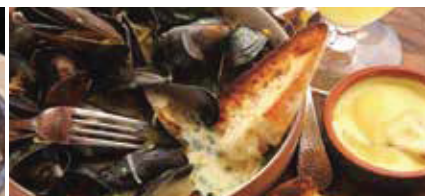
3 Course Meal – Mussels Meals